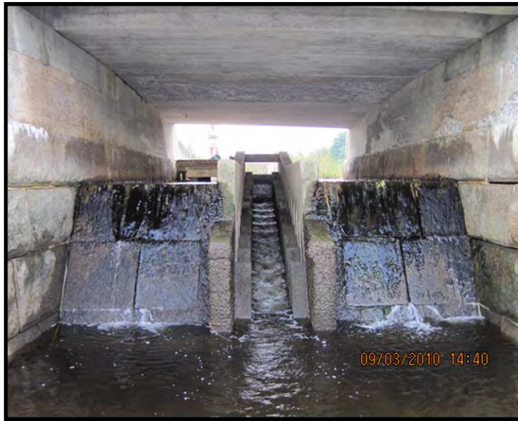
Winnegance Creek Dam with fish ladder, Phippsburg

Dams were also surveyed as part of this project. Most dams are “severe” fish passage barriers as they lack fish ladders. Nineteen dams were surveyed and only three have fish ladders, one of which leaks and is in need of repair. Representative photos of dams with and without fish ladders are shown below.